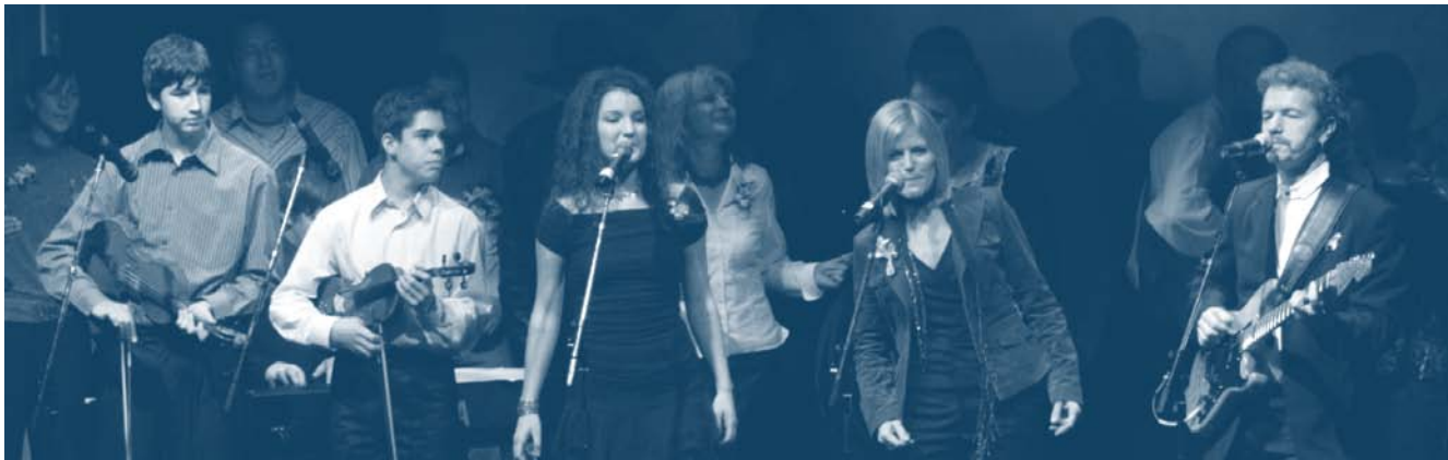
Performers at Saskatchewan Centennial Celebration in Ottawa.

Cultural tourism continues to thrive in Saskatchewan. SaskCulture is part of a Tourism Saskatchewan team, which includes representation from the Saskatchewan Culture, Youth and Recreation, Saskatchewan Arts Board, Aboriginal Tourism Association, Saskatchewan Festivals Association and Museums Association of Saskatchewan. This group is working to further advance cultural tourism and the needs of community partners in Saskatchewan. The work plan prepared by this group is part of Tourism Saskatchewan's overall strategic plan.