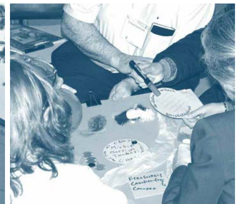
Craft classes interest many.