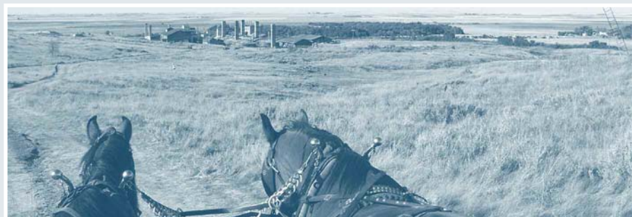
Wagon ride to Claybank Brick Plant.