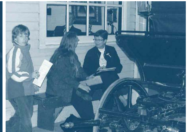
Summit participants in Saskatoon.