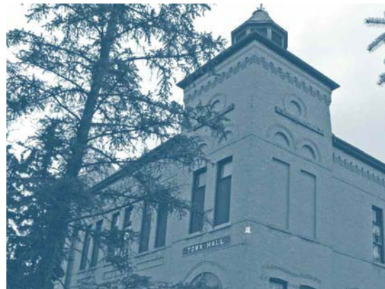
Historic Qu'Appelle Town Hall and Opera House.