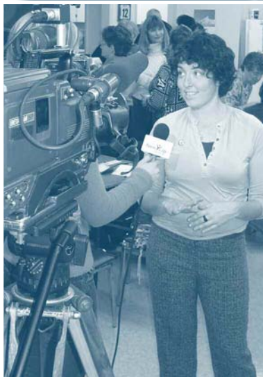
Artist in residence working with Nature Saskatchewan in St. Walberg.