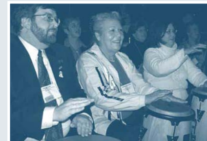
Drumming part of 2005 SaskCulture gathering.