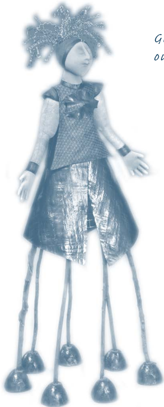
Creation from 2005 Emma Collaboration.

Guided by the Board's long-term Ends, SaskCulture's priority outcomes for 2005/2006 were to: