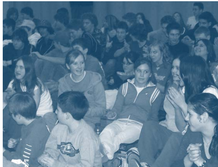
Youth from McLurg School gather for the Saskatchewan Student Heritage Project Presentation in Wilkie.