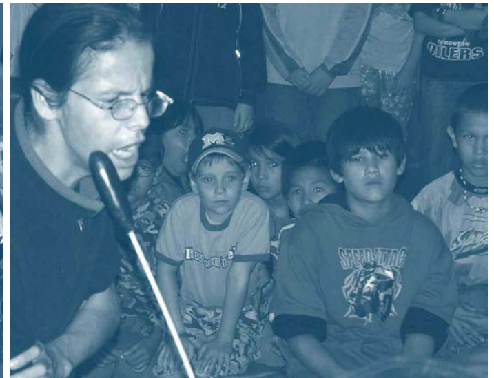
Drumming in Meadow Lake.