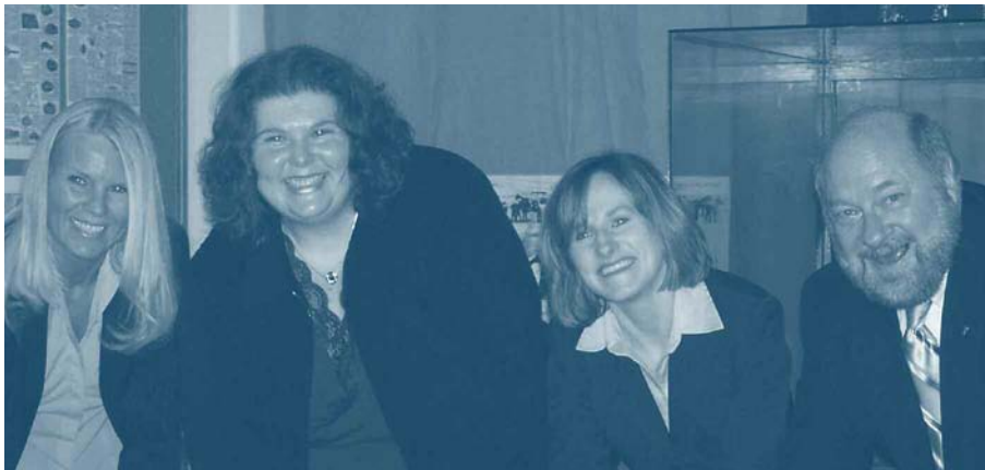
Lottery Licence Agreement signing in Regina.

SaskCulture partnered with the Arts and Cultural Industry Association of Manitoba to create a governance resource for cultural organizations, as well as to hold televised governance workshops. Several members of Saskatchewan's cultural community met in four separate locations for a special SCN network-linked workshop on effective governance. The Governance Works! resource book, developed specifically with cultural groups in mind, was distributed to SaskCulture members and volunteers.