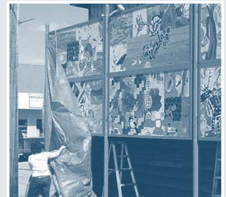
Murals unveiled in St. Walberg.