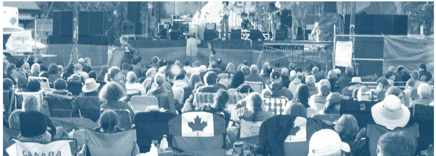
Folk Festival in Regina.