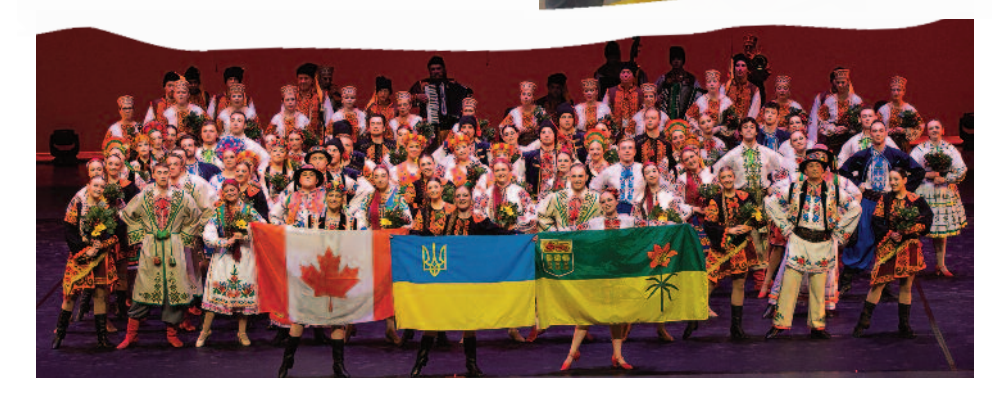
Volunteers across Saskatchewan have contributed to a culturally vibrant province.