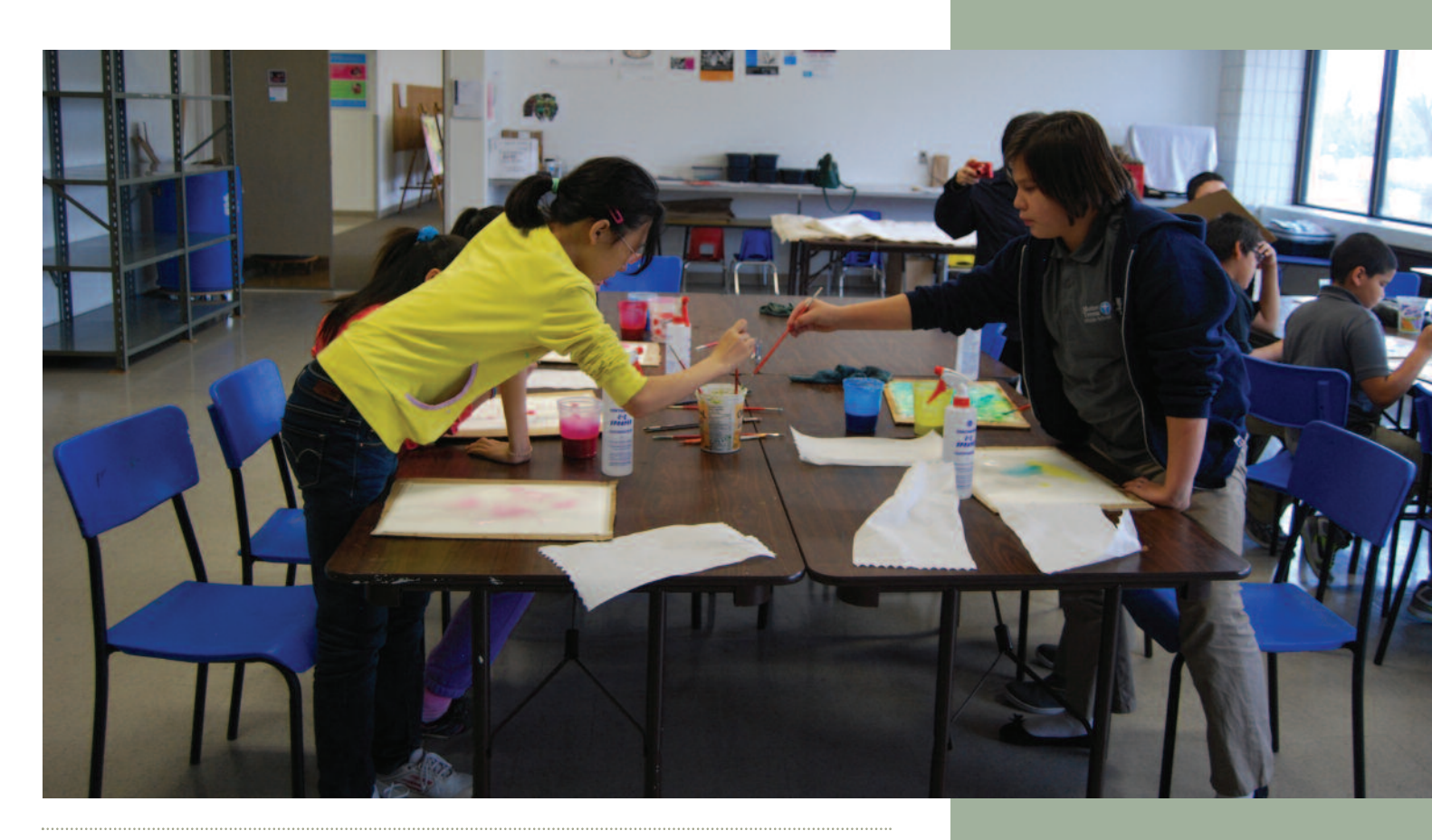
Students involved in the program come together at the MacKenzie Art Gallery to tour exhibitions with gallery facilitators and engage in discussion.