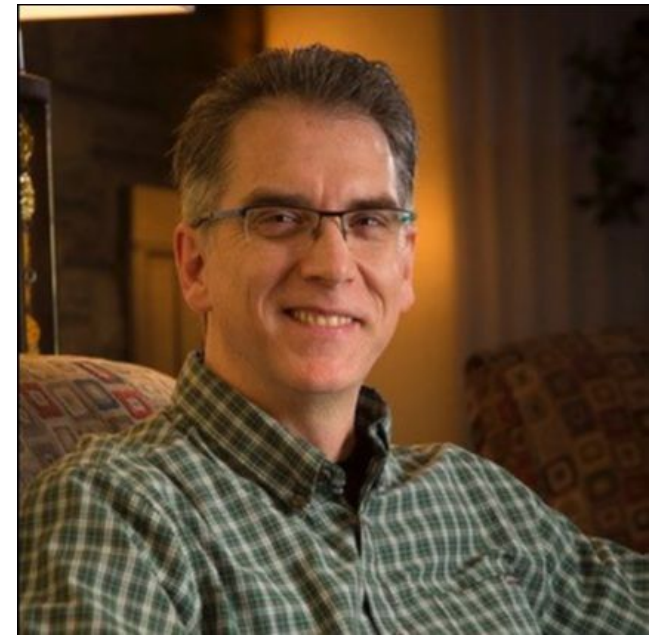
Virtual Writer-in-Residence Program