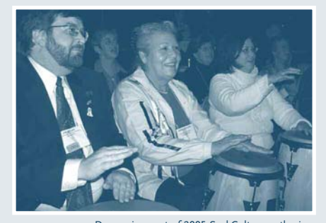
Drumming part of 2005 SaskCulture gathering.