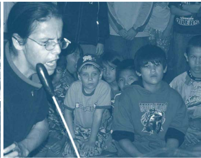
Drumming in Meadow Lak