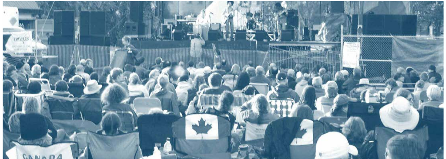
Folk Festival in Regina.