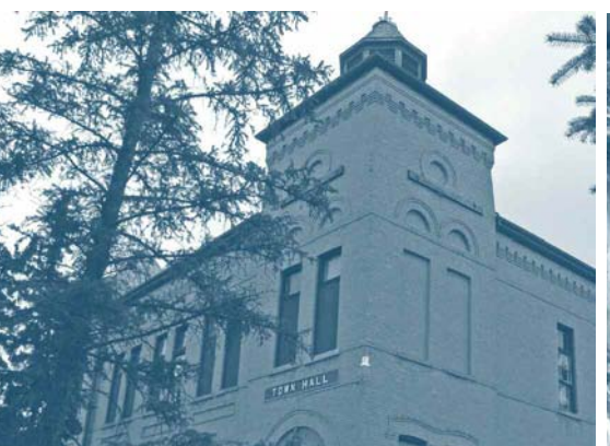
Historic Qu'Appelle Town Hall and Opera House.