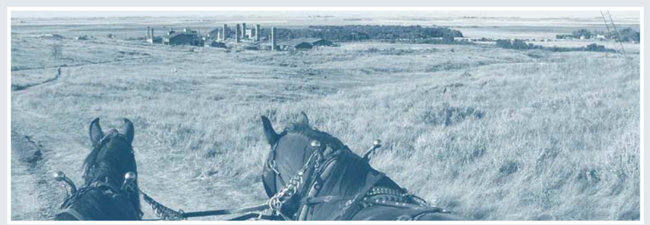
Wagon ride to Claybank Brick Plant.