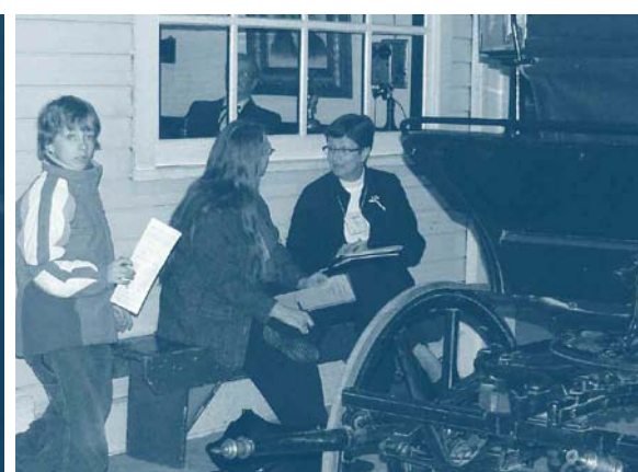
Summit participants in Saskatoon.