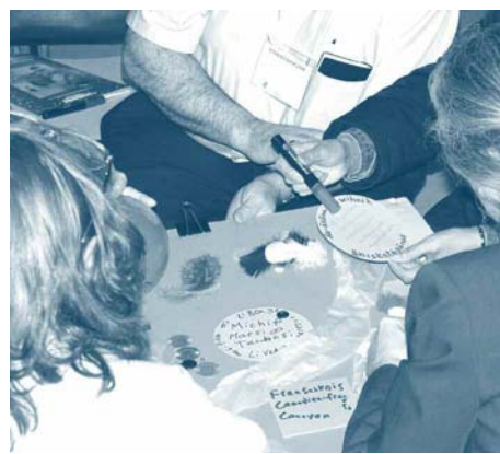
Craft classes interest many