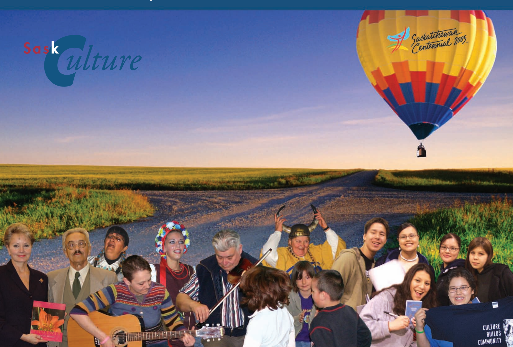
Culture Builds Community during 2005 Saskatchewan Centennial and Beyond