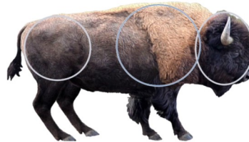
How To Draw A Buffalo

In the blank area next to the sample drawing, draw your own circles – the same shape, size and placement as in the sample.