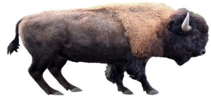
How To Draw A Buffalo

Sketch book, detailed sample drawing, pencil, pencil sharpener, glue stick and eraser.